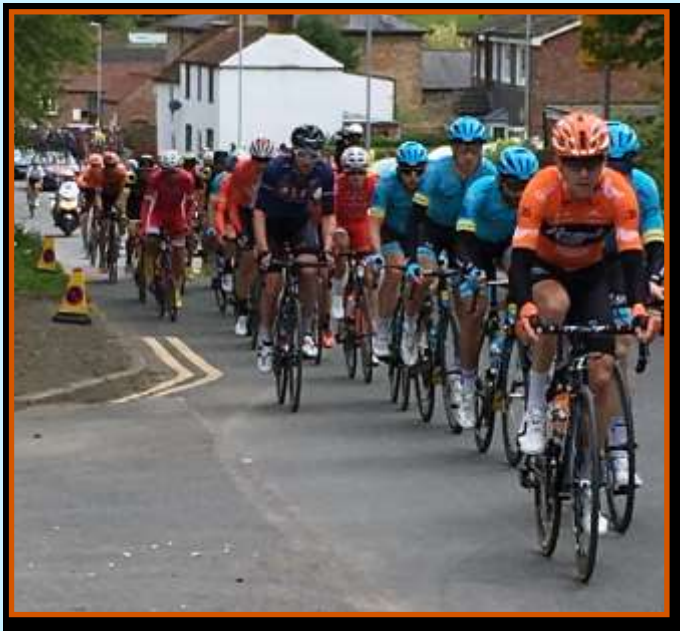
Photo taken of the 2018 race